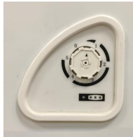
Normal Operating Temperatures